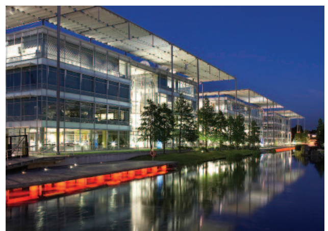
MAIN : Salford Quays MANCHESTER